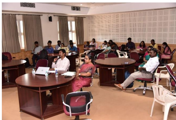
Q&A during Session 4