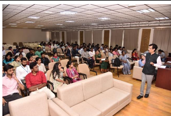
Participants at Plenary Session