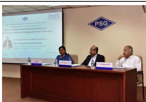
Dignitaries during the Inauguration