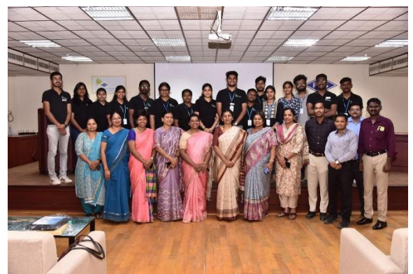
CRMT 2025 Organisation Team with Student Volunteers