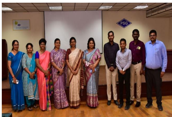
CRMT 2025 Organisation Team