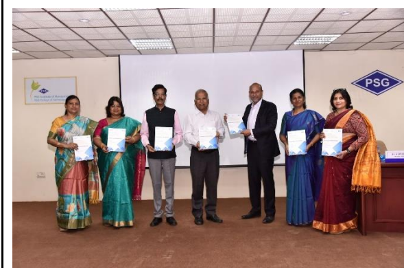
Release of the Conference Proceedings (Abstracts)