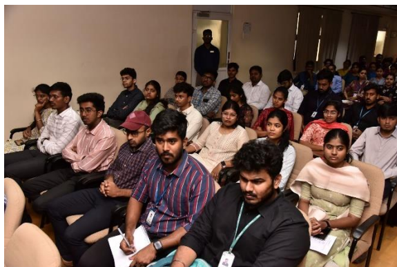
Participation of Students in Conference