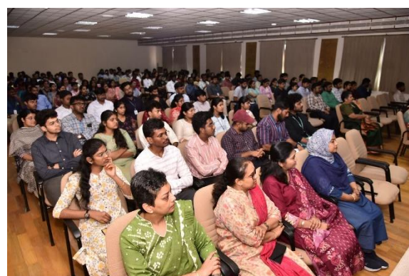
Inauguration - Snapshot 5