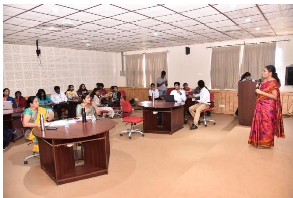
Paper Presentation by a participant