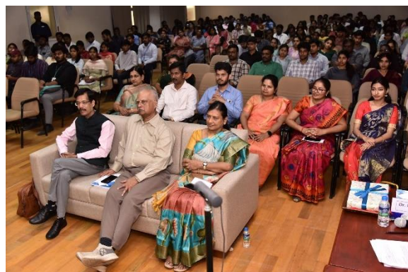
Inauguration - Snapshot 2