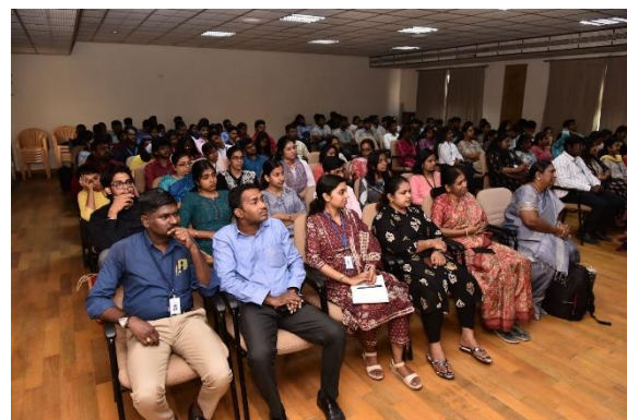
Inauguration - Snapshot 3