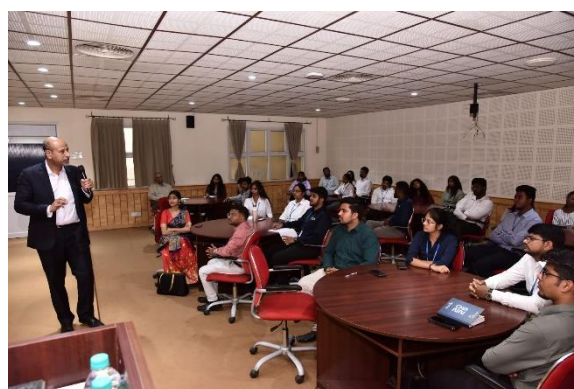
Participants at Keynote Address