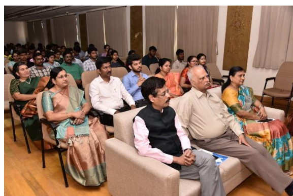
Inauguration - Snapshot 4