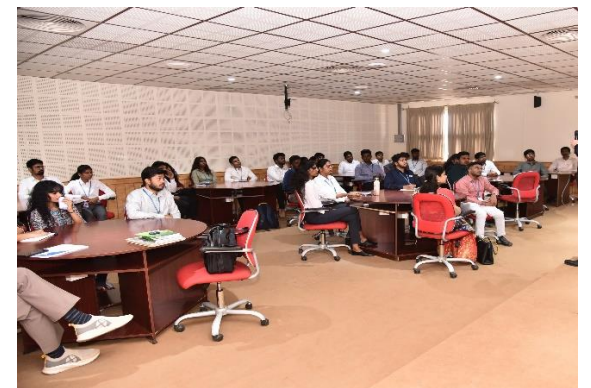
Snapshot of participants